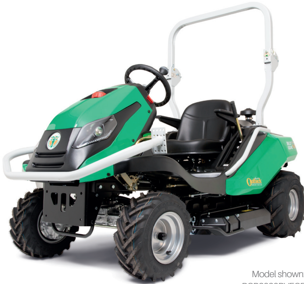
Model shown: BCR3626BVECE

4WD - Professional use Ideal for rough terrain, hillsides and high vegetation