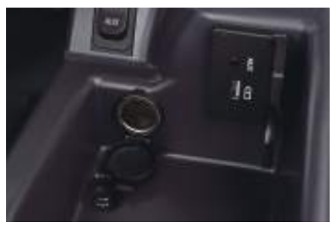
USB and Power Socket

The operator can simply engage the S-PTO switch whenever the operator needs to run PTO other than the seating position