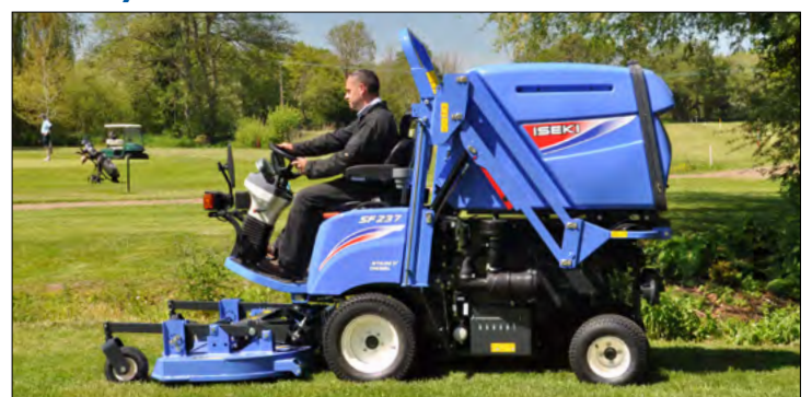
SF225/237 with collector

Either the fuel efficient, Stage V compliant 22.5hp SF225, or the high performing SF237 with Stage V 35hp engine.