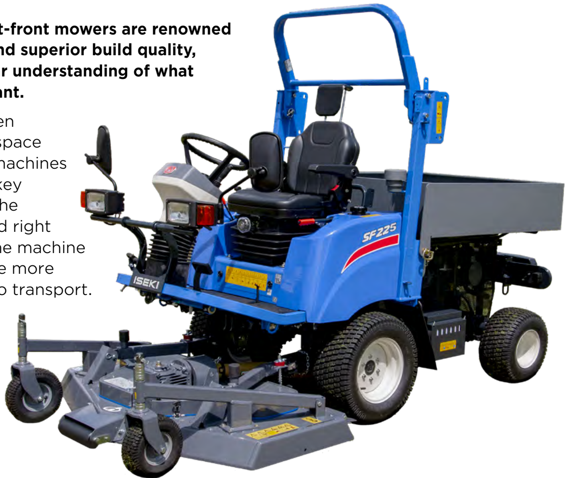
SF225 with storage box

Rotary cut and drop or rotary cut and collect, flail cut and drop or flail cut and collect, these machines truly do it all.