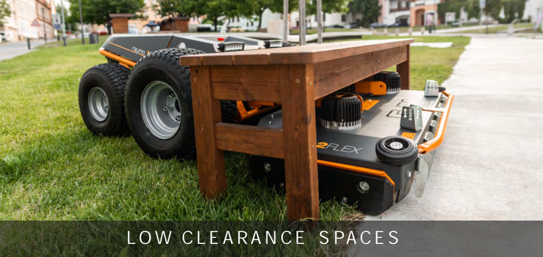
LOW CLEARANCE SPACES