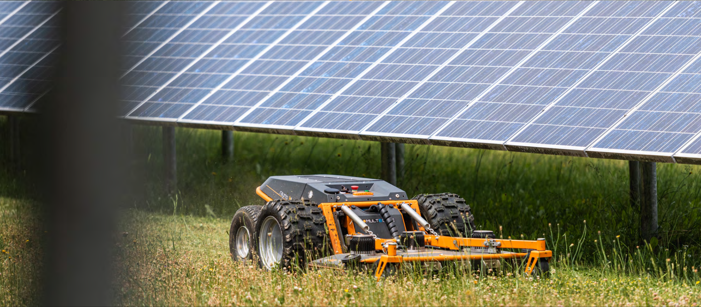
ENERGY PARKS / SOLAR FARMS