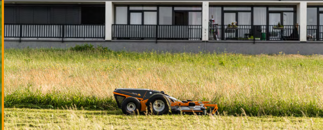
NOISE REGULATED AREAS