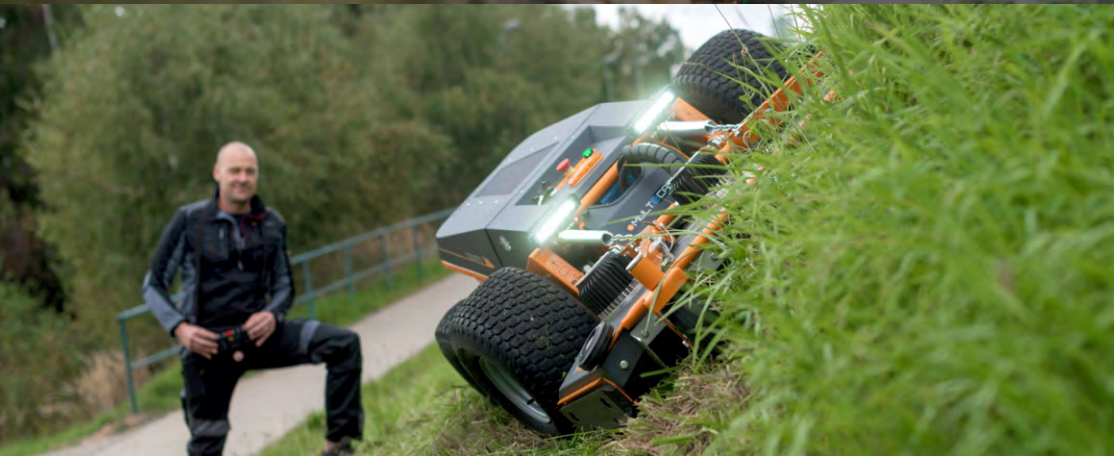
SLOPES AND EMBANKMENTS