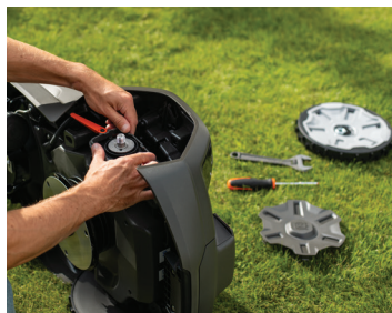
AUTOMOWER® WHEEL CLEANER